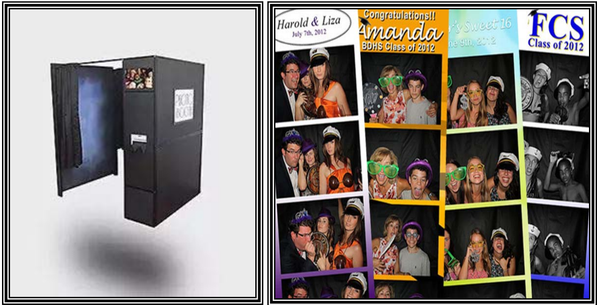
Photo Booth Rentals